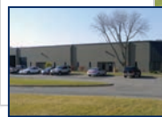
New Hope, Minnesota