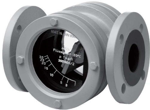
Fig. 1 F I Intra flap flowmeter for transparent liquids