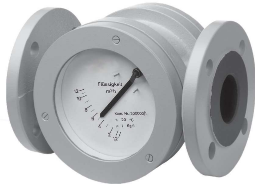
Fig. 2 F I Prima flap flowmeter for opaque liquids