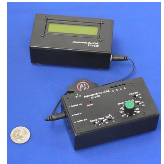
Pulse Speed Display & Controller